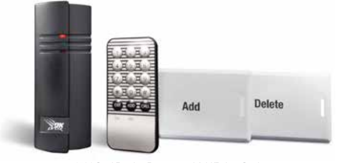
1524 Card Reader, Remote, and Add/Delete Cards