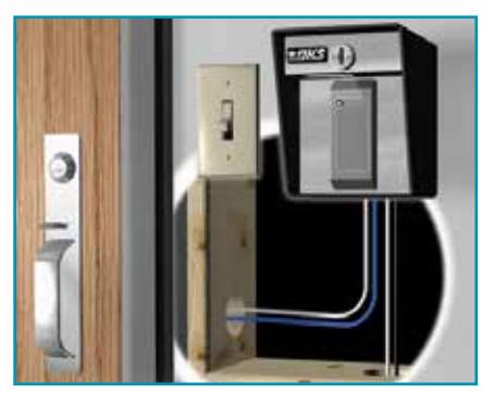
simple wiring easily connects to most electric stikes and magnetic locking devices as well as input from weigand controllers