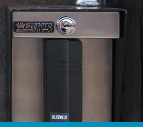
• RESIDENTIAL • COMMERCIAL