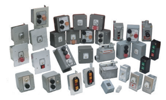
Complete selection of control stations & accessories are available.