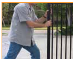
fail-safe release never be locked out (or in)