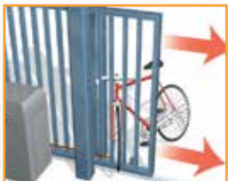
entrapment detection reverses gate when obstructed