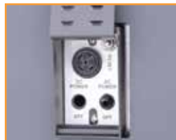
built in power switch and reset switch