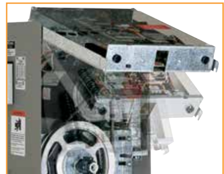
unique design allows easy access to all mechanical parts