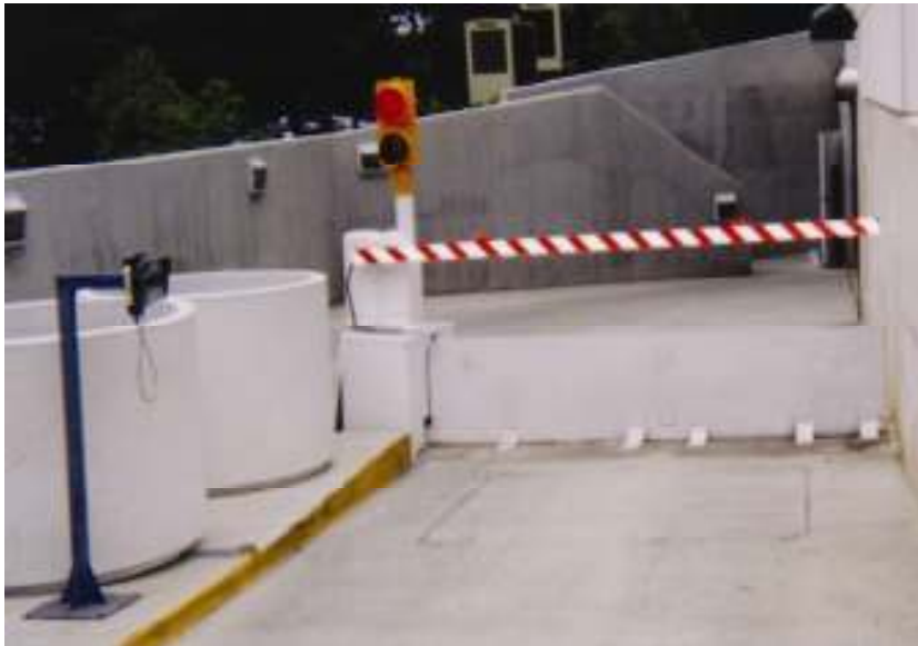
Model 890 Surface Mount Barrier

In the active (up) position, the barrier stands 24 inches (61.0 cm) high and lowers to the ground to allow authorized vehicles to pass. The standard barricade plate is 9 feet (2.7 m) wide but may be customized to sizes up to 14 feet (4.3 m).