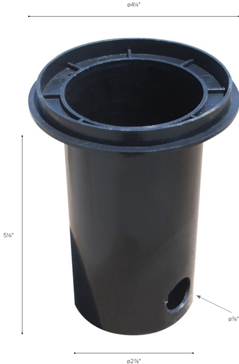
CPX Concrete Pour Box

Content of specification sheet subject to change