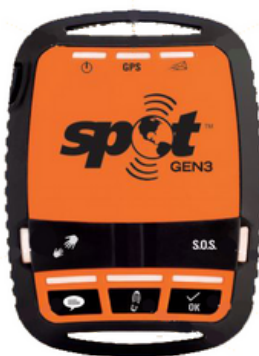
SPOT Gen3 Satellite Tracker