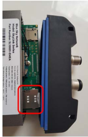
Flip terminal for Iridium SIM slot