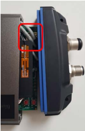
Cellular SIM slot

Insert the cellular SIM card in the slot behind the connectivity port, taking care not to damage the cable wires. Then, flip the device and insert the Iridium SIM card into the slot. Re-attach the bottom panel and tighten the screws, taking care not to damage the cable wires.