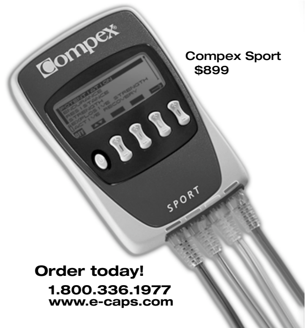
Compex Sport $899

Each unit comes complete with 1 set of 2" x 2" electrodes, 1 set of 2" x 4" electrodes, leadwires, user manual, training planner CD, the electrode placement booklet, battery charger, and a carrying case.