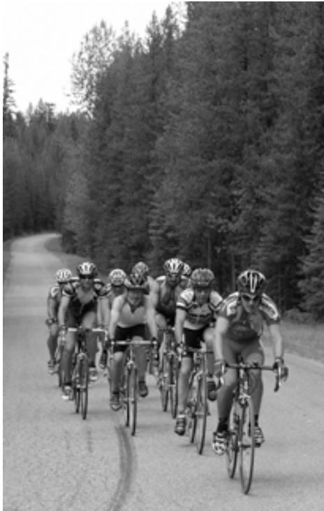
Some of the participants in last years' ride