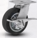
Side Lock Brake Specify BRK3