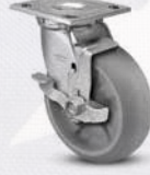
Top Lock Brake Specify BRK7