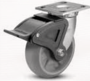
Total Lock Brake Specify BRK4