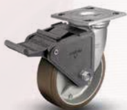
Tech Lock Brake Specify BRK2