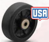
Trans-forma LT Flat and Round