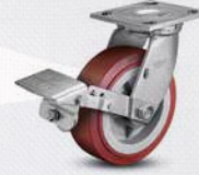
Tread Lock Brake Specify BRK1