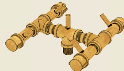
CFB60 - Crossfire 60K System shown with Natural Gas Jets. Liquid Propane also available