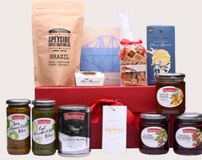
The Lomond £70