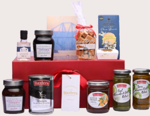
The Ness £70

Show your appreciation and gratitude by sending a luxury Gift Box to say 'Thank you', 'Good luck', 'Congratulations' or even 'Merry Christmas' on special occasions to important key stakeholders in your business. Shop our Baxters of Scotland corporate gift range to secure the best of Scotland today.