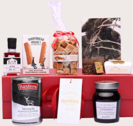
The Tay £49