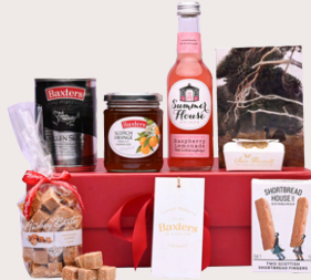
The Maree £49

Treat yourself to something extra special