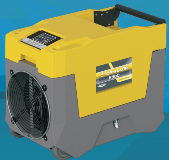
Storm SLGR 850C

The humid air reaches the saturated steam state after passing through the microchannel pre-cooler, and the evaporator cools the air to below the dew point, hence increasing the water vapor condensation rate to a liquid, therefore, dehumidifying the air. The dehumidified air is heated by the condenser, then discharged.