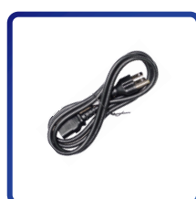
Power Cord x 1