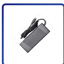
12V Power Adapter x 1