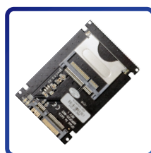
CFast to SATA Adapter-P1053