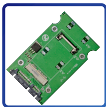
mSATA to SATA Adapter-P1041