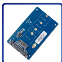
M.2(NGFF) to SATA Adapter-P1051