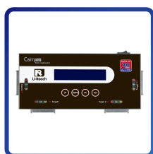
PRO398 Duplicator x 1