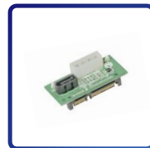
SATA DOM Adapter*

*There are 3 types of power supply for SATA DOM cards. Please double check before purchase.