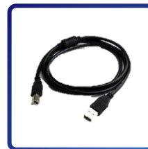
USB Cable for PC Link x 1