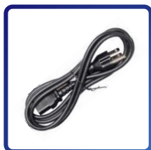
Power Cord x 1