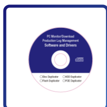
PC Link Software Disc x 1