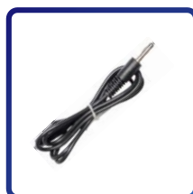
Grounding Cable x 1