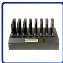
Duplicator x 1