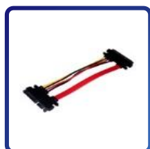
SATA 22PIN Extension Cable