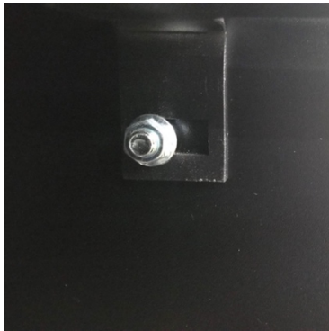
Adjustment to make padlock tighter to the door