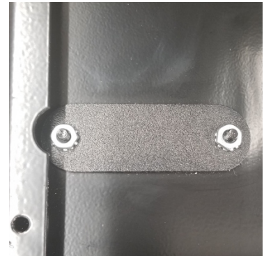
Metal plate that can be removed to add second padlock bar.