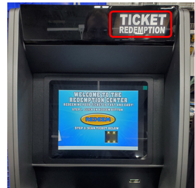
Pictured with the Power Supply on.

1. The M 5200 TRT is equipped with a UPS and a power supply. The power supply must be turned on to provide power to the CDU, printer, and front LED header.