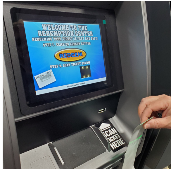
Correct Example Aiming the green line at the QR Code