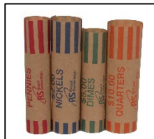
Coin Wrapper Starter Pack