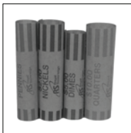
Coin Wrapper Starter Pack