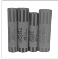
Coin Wrapper Starter Pack