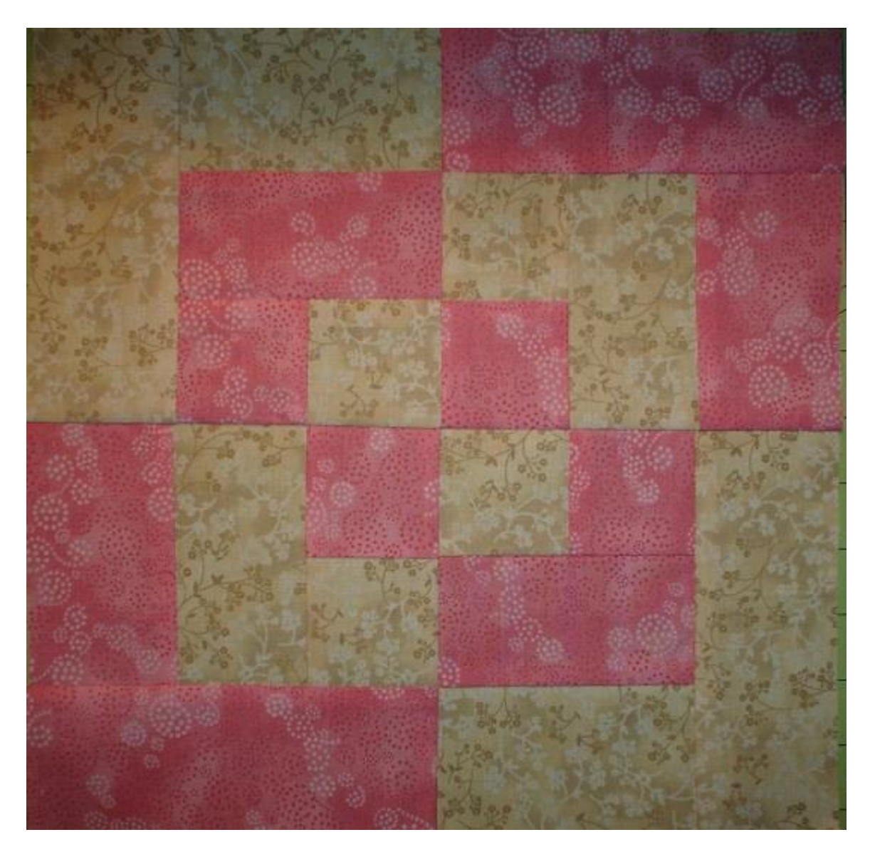
You will not believe how fast and <u>easy</u> this pattern is!

Hop over to my <u>Bento Box Pinterest Board</u> to see over 100 other examples with every color combination imaginable!