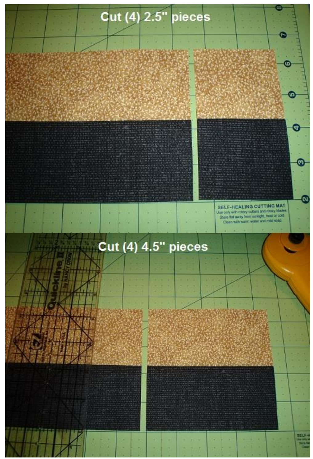
You will have just a little scrap at the end to toss! Very little waste!

3. Next, cut (4) 2.5" segments and (4) 4.5" segments.