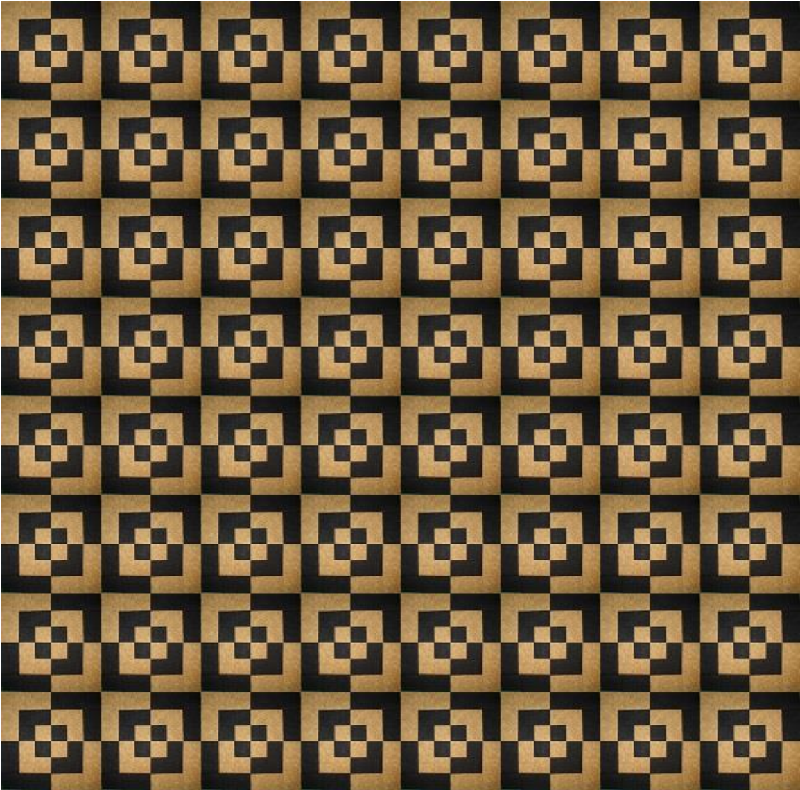
96" x 96" Queen Size

This block can be made in any two (or more) colors you like but will be more striking with a dark and light color! It's extremely easy to make using 2.5" strips. 20-strip rolls will be the most efficient use of fabric for this pattern - you can find all our 20-strip rolls here!