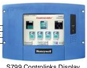
R485 Interface Port