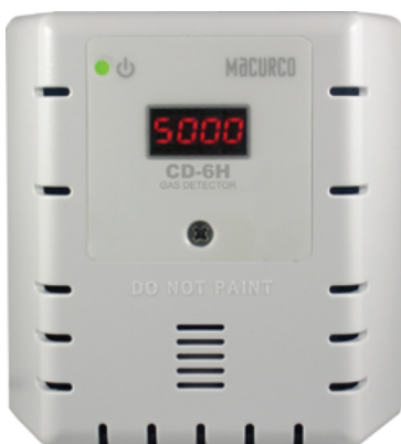
White Housing Option