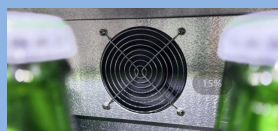
Internal air flow