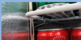
6 Adjustable shelves