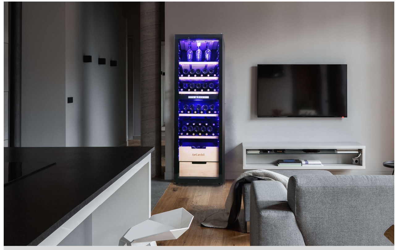
Actual color may vary. Design, specifications, and color availability are subject to change without notice, check lecavist.com for up-to-date information. © Lecavist | Australia JUN22.V01