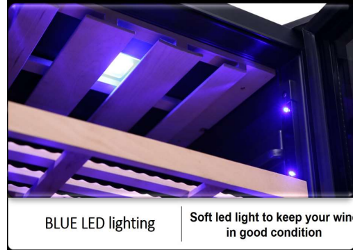
BLUE LED lighting

Reduce the vibration and protect from the sunlight