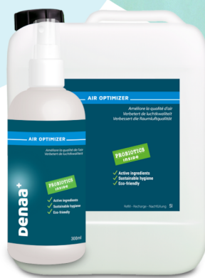
DENAA+ Probiotic Air Optimizer: for Public Places, Offices, Shops, Hotels & Schools