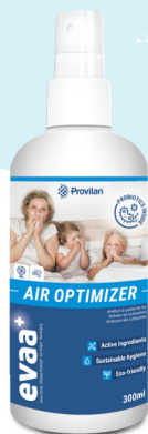
EVAA+ Probiotic Air Optimizer: for Homes