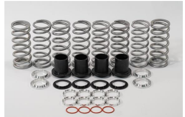
Picture may vary from kit ordered

Step 1: Layout and Organize products in an area of your choosing, Step 2: Removing the shocks from the machine