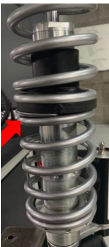
Springs sitting on arrows

***Note: Having to compress the spring kit 3"-5" is normal***