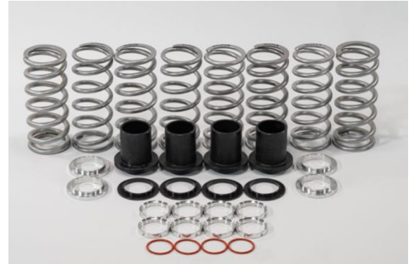
Picture may vary from kit ordered

Step 1: Layout and Organize products in an area of your choosing,