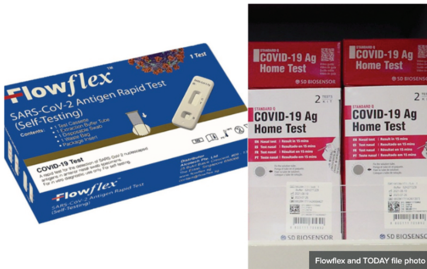
Flowflex and TODAY file photo

Samples of antigen rapid test kits: (from left) Acon Flowflex Sars-CoV-2 Antigen Rapid Test (Self-Testing) and SD Biosensor Standard Q Covid-19 Ag Home Test.