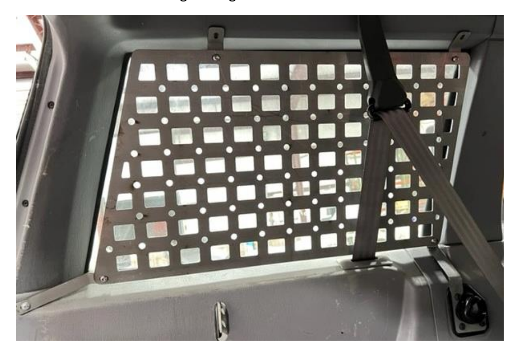
Step 6: (1996-)

Install the molle panel using the provided stainless steel button head bolts. We recommend using some anti-seize on these bolts. With the molle panel in the desired location, start tightening all the hardware.