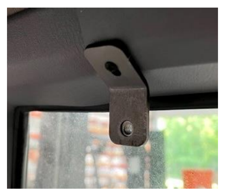
Step 4: (1997+)

Remove the rear upper trim screw and install the upper rear bracket with the factory hardware. Leave the hardware slightly loose.