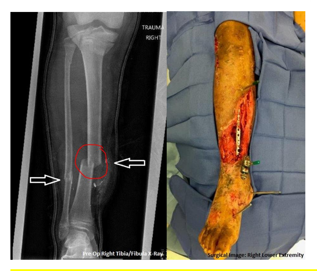
Above left is an X-Ray of Mr. Doe's Tibial fracture (red circle) and to the right is a picture of the surgical fixation of the fracture