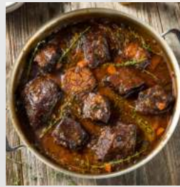
Bourbon Braised Short Ribs