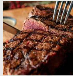
French Style Hanger Steak