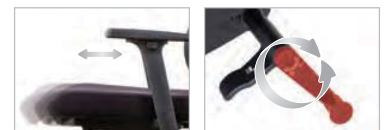
Seat Depth Adjustment Tilt Tension Adjustment