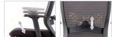
Armrest Height Adjustment Lumbar Support