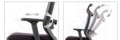
Multi-Angle Armrest Adjustment Synchronized Tilt