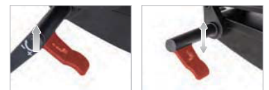
Height Adjustment Multi-Locking System