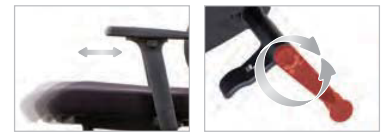
Seat Depth Adjustment Tilt Tension Adjustment