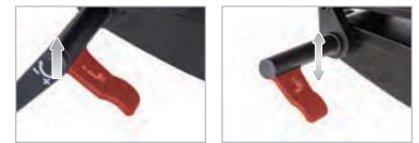
Height Adjustment Multi-Locking System