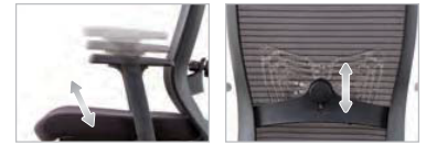
Armrest Height Adjustment Lumbar Support