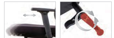
Seat Depth Adjustment Tilt Tension Adjustment