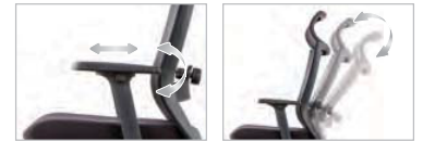
Multi-Angle Armrest Adjustment Synchronized Tilt