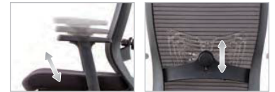
Armrest Height Adjustment Lumbar Support