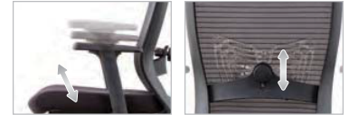
Armrest Height Adjustment Lumbar Support