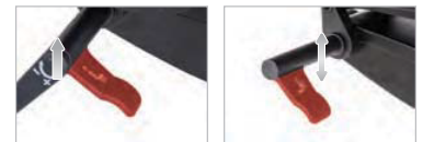
Height Adjustment Multi-Locking System