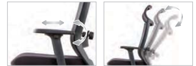
Multi-Angle Armrest Adjustment Synchronized Tilt