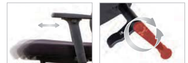
Seat Depth Adjustment Tilt Tension Adjustment