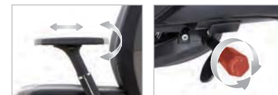
Multi-Angle Armrest Adjustment Tilt Tension Adjustment