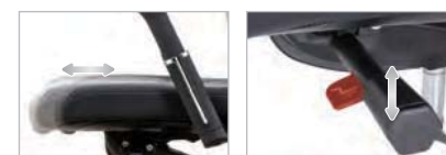
Seat Depth Adjustment Multi-Limited Tilt Adjustment (3Level)