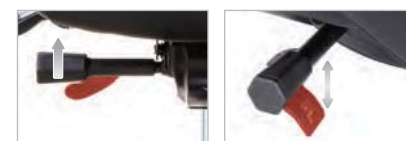
Height Adjustment Multi-Locking System