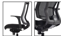
Lumbar support function