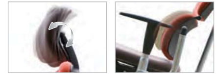
Headrest Tilt Adjustment