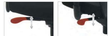
Height Adjustment Multi-Locking System