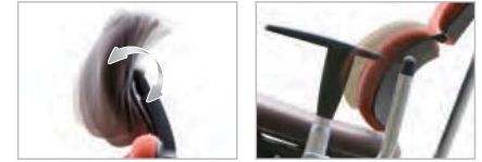
Headrest Tilt Adjustment Lumbar Support

* Artificial Leather (25.2W23.43Dx46.46H)