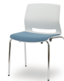
DM1-105 22 x 20 x 31