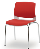
DM1-106 22 x 20 x 31