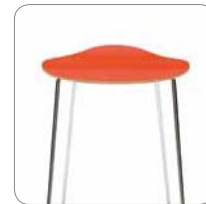
Simple Stand-type Chair