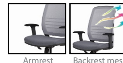
Armrest Backrest mesh