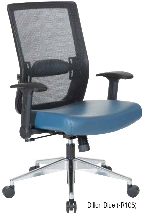
Dillon Blue (-R105)