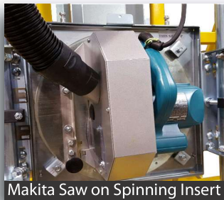
Makita Saw on Spinning Insert