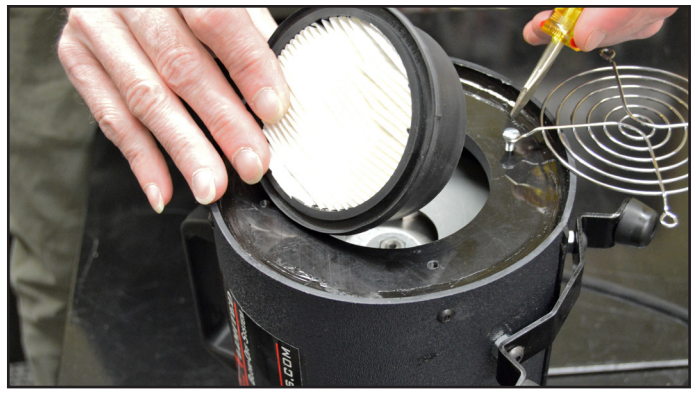
Figure 3. Changing the air filter.

The air filter is located on the non-hose end of the portable Jet-Kleen Limited unit. The filter is accessed by removing the filter guard, which is secured with four screws. Simply pull