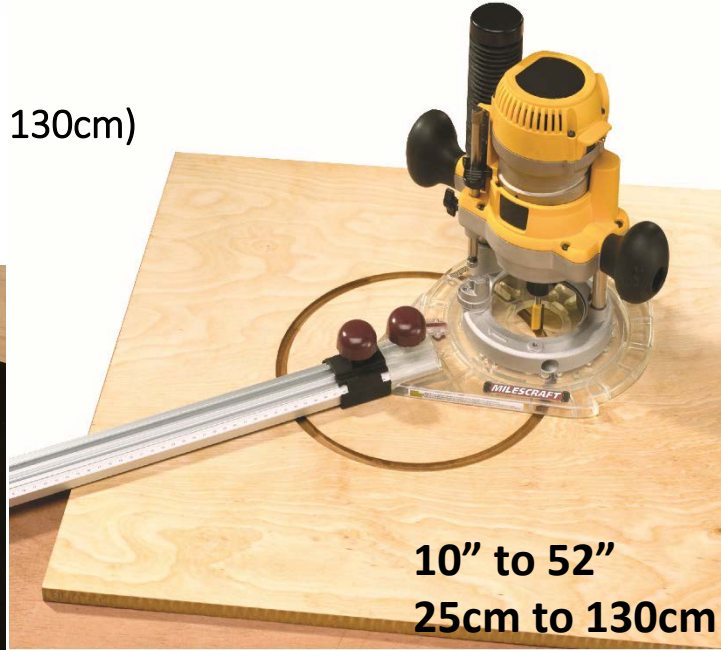
10" to 52" 25cm to 130cm