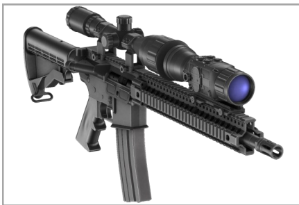
Clip-On (In-Line) Sight

Every TI-GEAR-C345 Clip-On Sight can be used in 3 main configurations