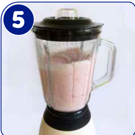
Making sure the lid is on, whizz up the ingredients until all blended together