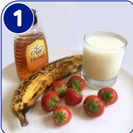
Get your ingredients together