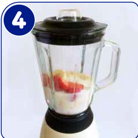
Place all the ingredients into the blender taking care not to touch the blade