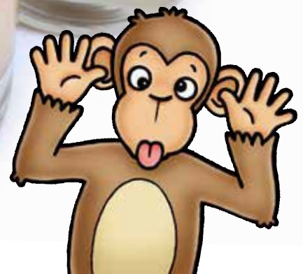
Makes two servings

Pour your smoothie into glasses, decorate with strawberries, add straws and ENJOY!!!