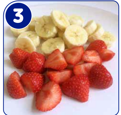
Wash the strawberries and cut them in half